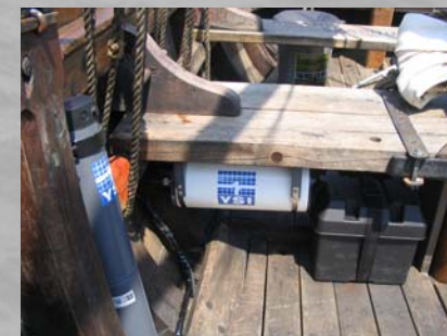
YSI Custom Continuous Underway Water Quality Sampling System for the Shallop