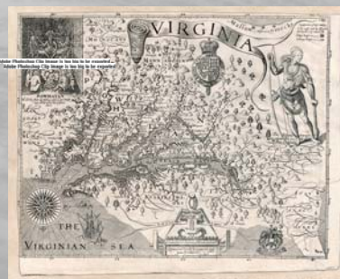
John Smith's Map of the Chesapeake Bay from his 1608 Voyages