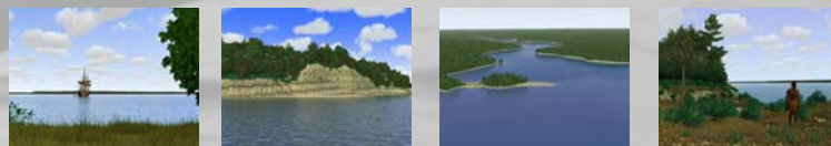
1608 Visualizations